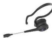
Behind the Neck