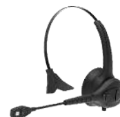
Wired and Wireless